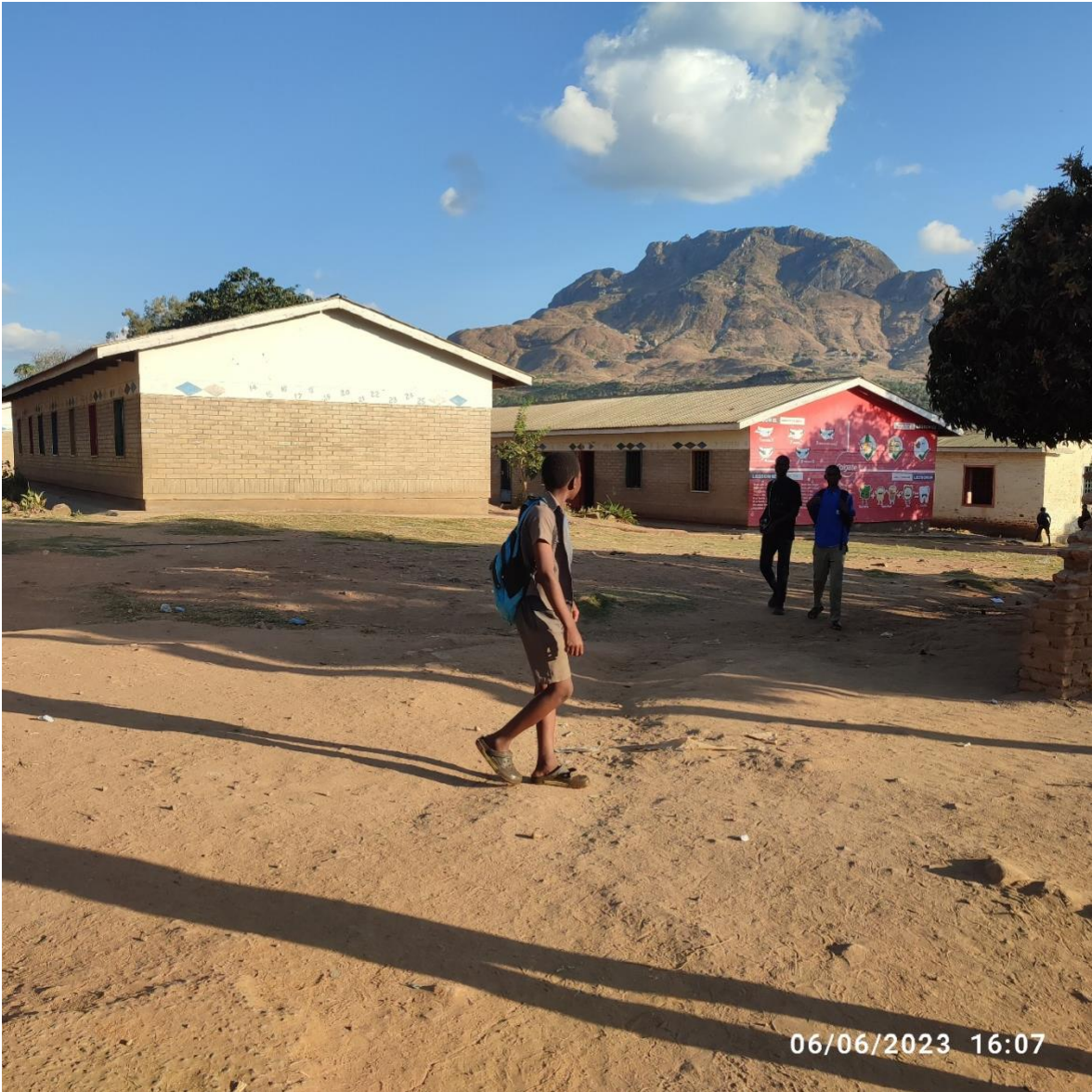
The front of the school (South Lunzu CCAP Primary)